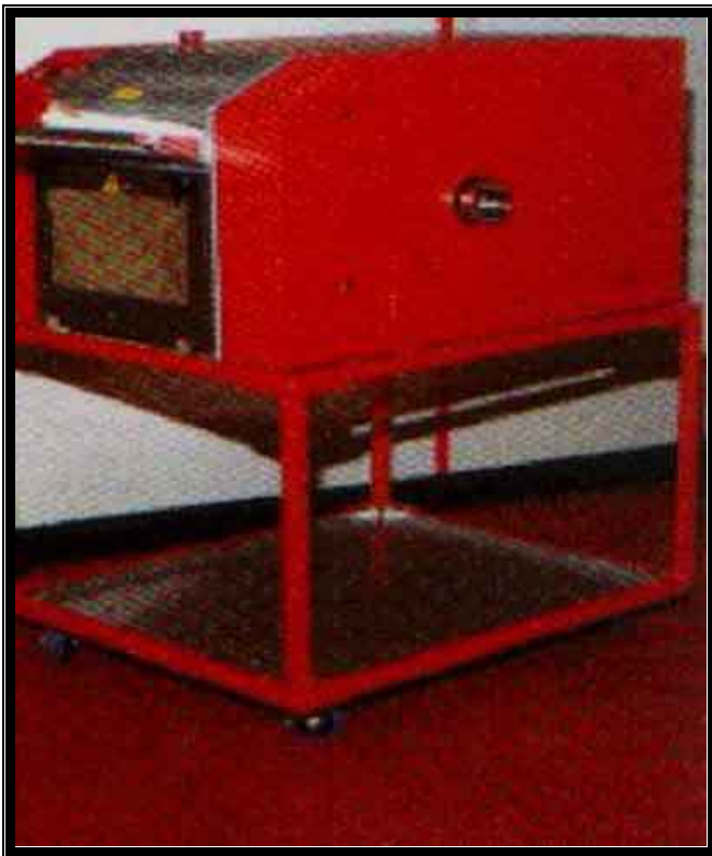
Trash Content Analyzer