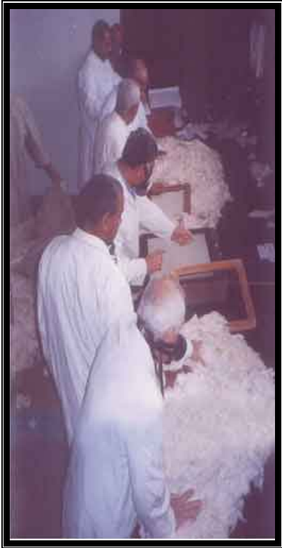
First Instance Arbitration