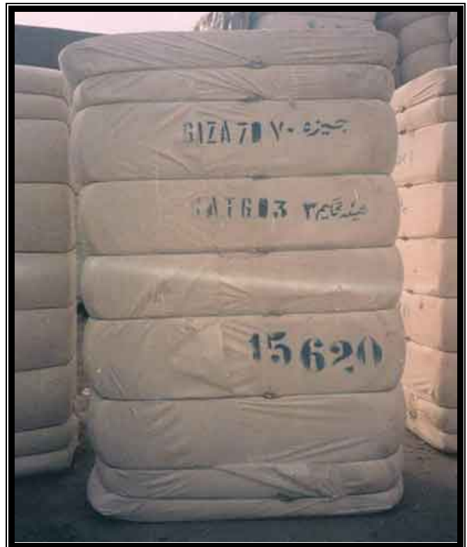
Bales Maked by CATGO assuring Purity of varieties