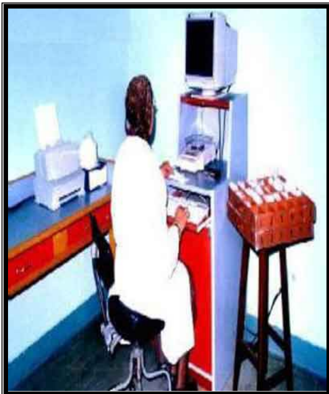
Cotton Fineness & Maturity Tester (Micromat)