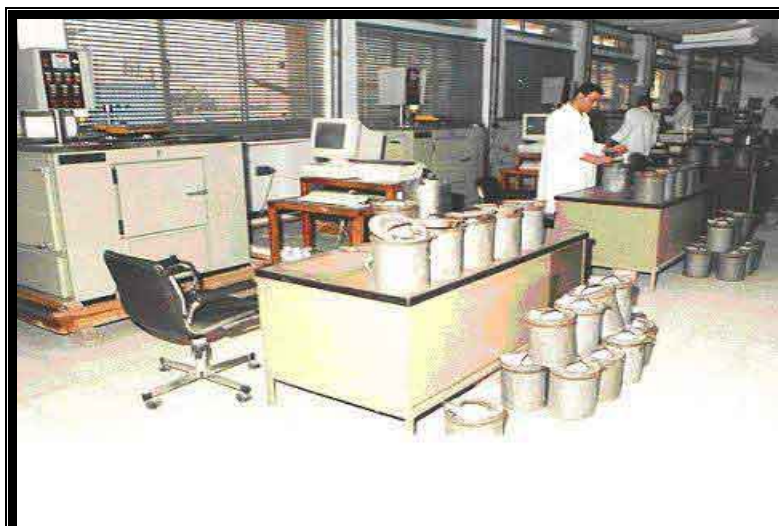
Modern Oven for Determining Moisture Content At CATGO's Laboratories