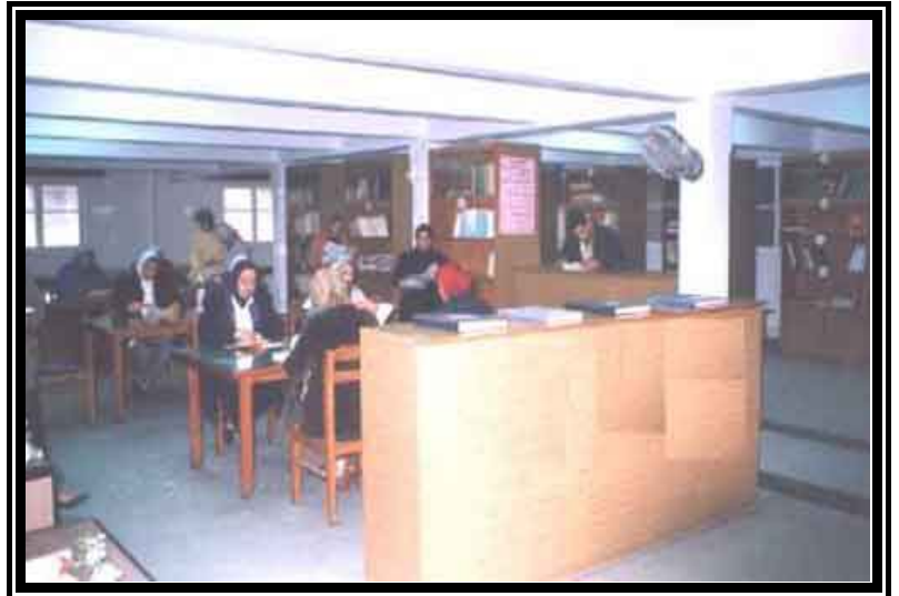
CATGO's Scientific Library