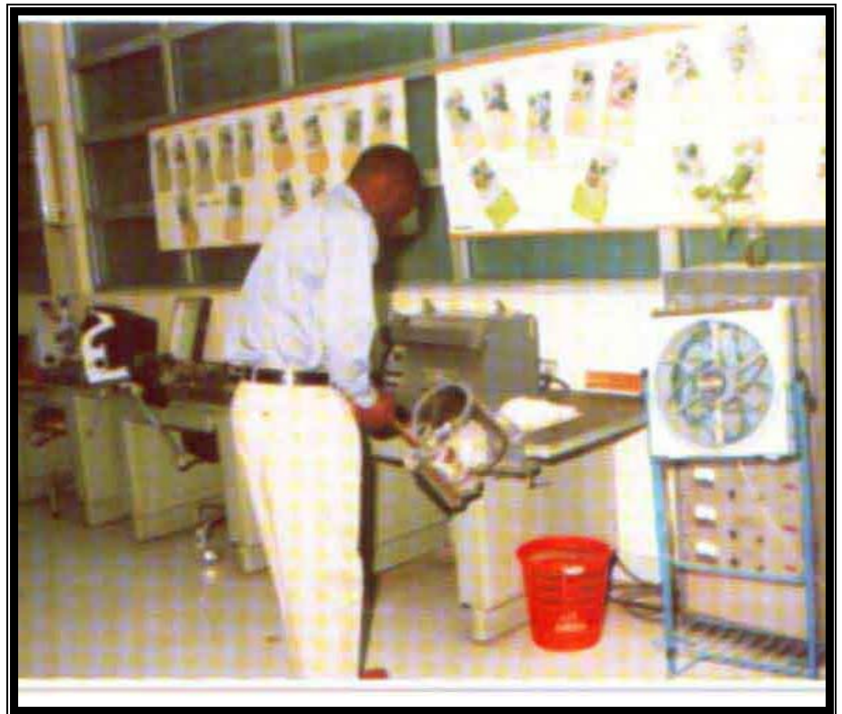
Practical Training For Foreign Trainee