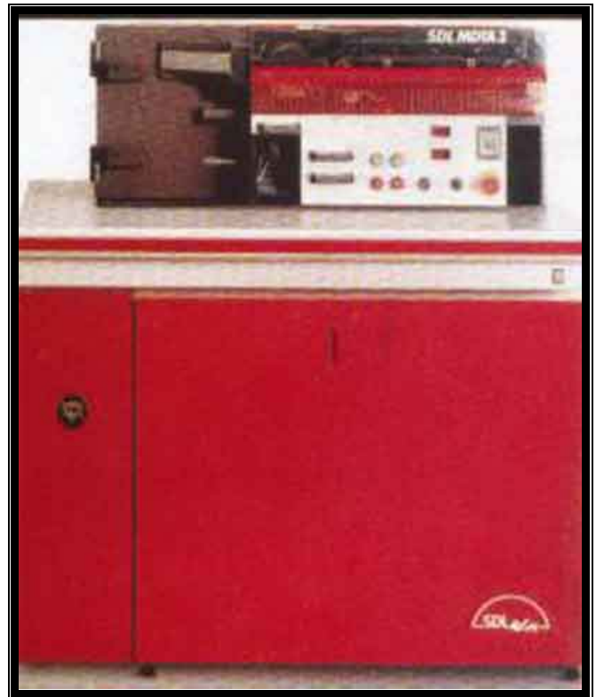
Microdust & Trash Analyzer ( MDTA3 ) For Determining Lint, Trash, Fragments And Microdust