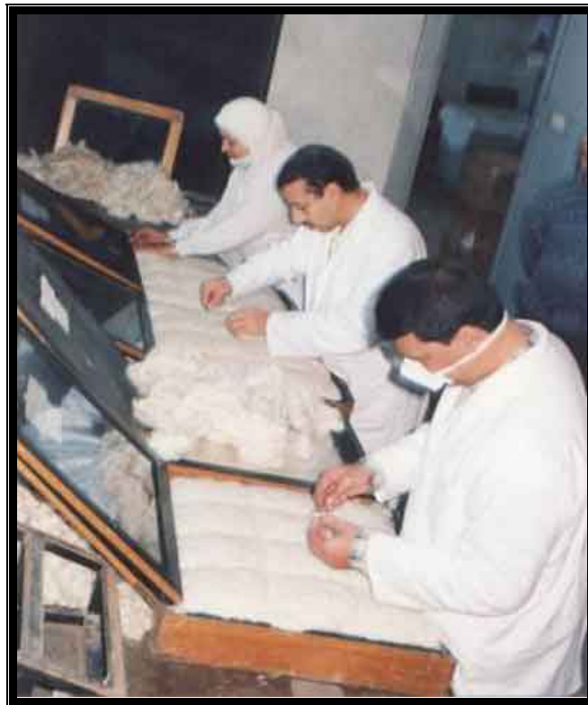
Preparing Standard Grade Boxes Of Egyptian Cotton