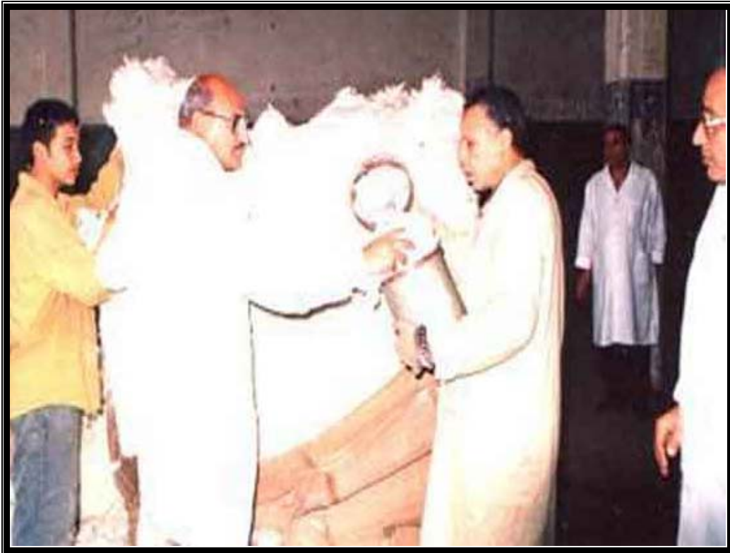
Drawing Samples For Moisture & Arbitration Testing from Ginning- Yard, Spinning Mills and Trading Companies Founded in ( 176 ) location