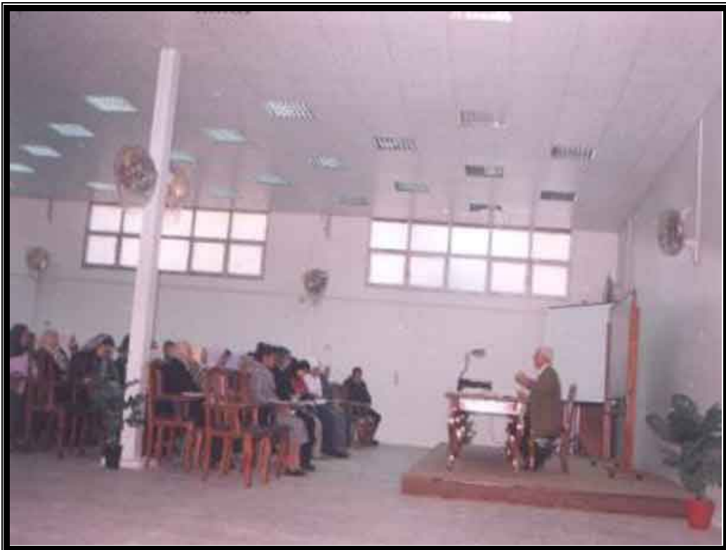
The Modern Classification Training Hall