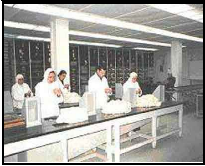
Modern Classing Room of International cotton Training Center ( CATGO )