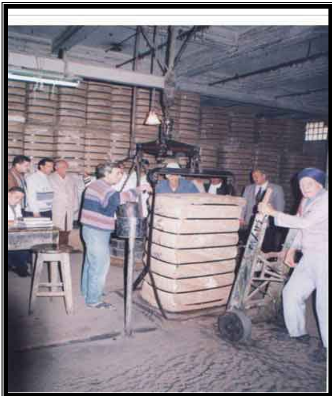
Steam Press Bales Prepared For exporting