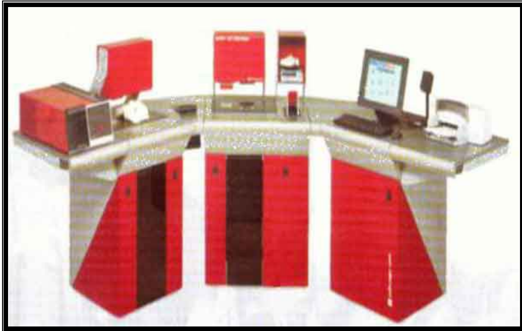
Updated H.V.I Spectrum II for Testing Fiber Properties (Length – Length Uniformity- Short Fiber Index- Strength- Elongation- Fineness- Maturity- Trash- Color)