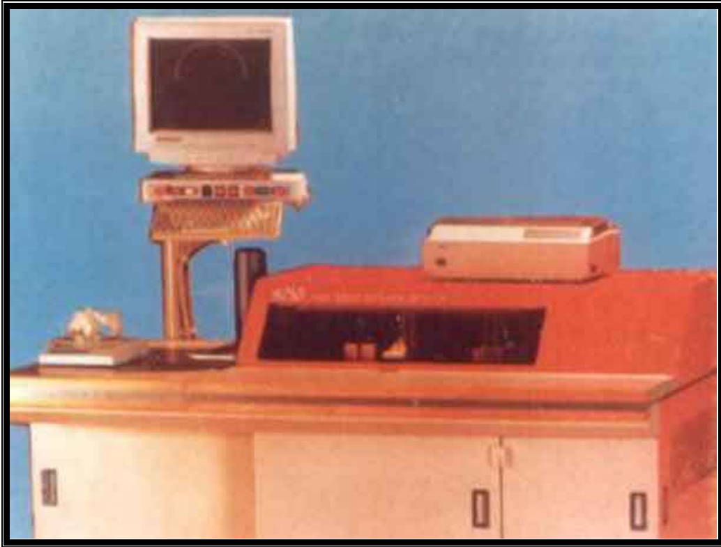
High Speed Stickiness Detector ( H2SD )